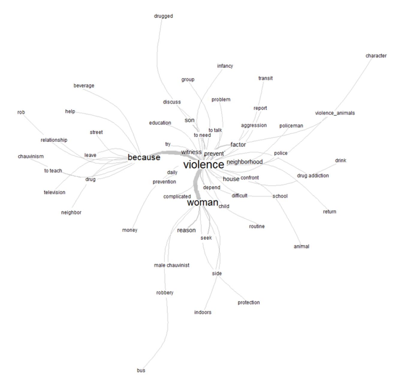
Figure 2 – Similarity analysis on the corpus violence. Rio Grande, RS, Brazil, 2021

in robberies and shootings,<sup>23</sup> which can explain the evocation of users with the terms drink/drink, drugs/drug use, robbery/ robbery. Because it is present in the community and often within family relationships, the participants understand that witnessing and/or encouraging violence is harmful to child development (childhood/childhood/presence), as already evidenced by scientific studies that discuss the damage to physical and mental health, as well as the production and reproduction of violence in adulthood.<sup>22,24-25</sup> Finally, the evocation of terms such as machismo/ machista and the explanation of situations of violence against women demonstrate the strong prevalence of this situation in the