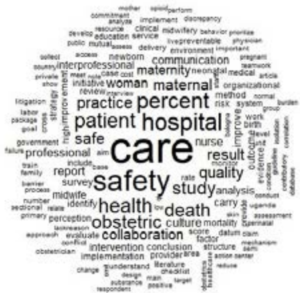
Figure 3 - Word Cloud General Corpus. Recife, PE, Brazil, 2022

In Figure 3, it is possible to see that in the first sphere, the word "safety" stands out with a frequency of 237, followed by the "care", "percent", "health" and "obstetric" words, which appear 103, 73, 67 and 55 times, respectively. It is noticeable how important these terms are within their scope. The term in the first sphere is the word that expresses the title and purpose of this study. Whereas 'care', 'percentage' and 'health' are terms that correlate with the title, objective, result and conclusion.