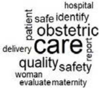
Figure 1 - Target word cloud. Recife, PE, Brazil, 2022