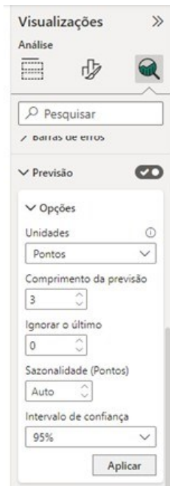
Figure 4 - Selecting the forecast. Rio de Janeiro, RJ, Brazil, 2023