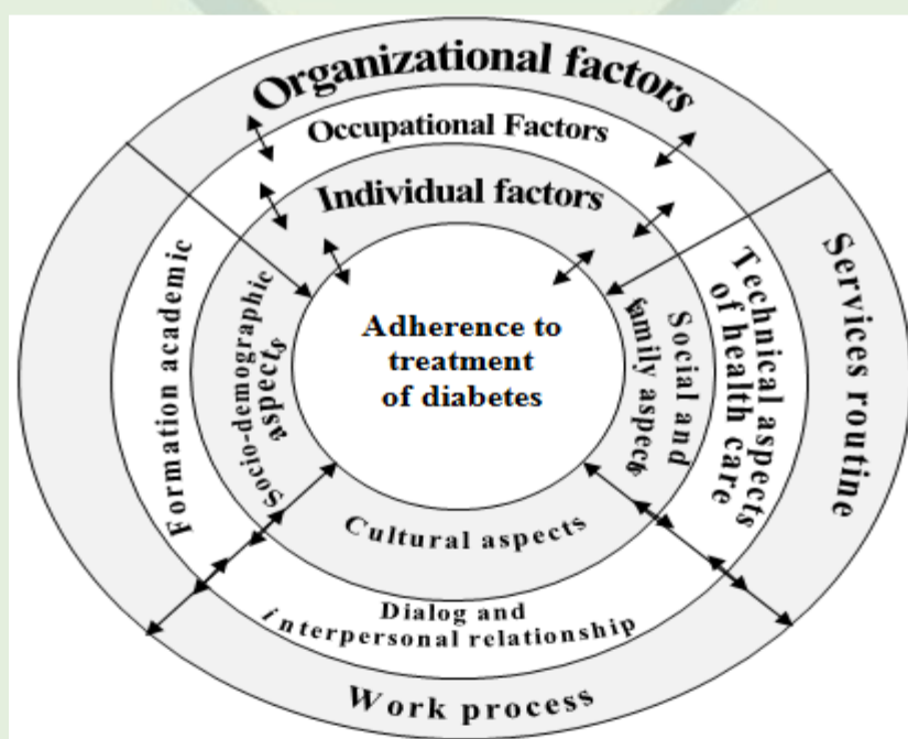
Figure 2 - limiting aspects of the practices of health professionals across the accession process to the treatment of people with diabetes.

Figure 2 was constructed as a way to represent the elements that limit the practices of health professionals in the accession process found in the articles analyzed. Evidence is a complex interaction of assumptions organizational, professional and individual explaining that such factors are presented as a true "web" of related elements multifactorial. The figure does not constitute a hierarchical model where a level has supremacy over another, instead, shows that the relationship between these elements occur not only unidirectional, but in multiple directions, making it clear that the interaction and interdependence of these limiting elements of the practice of health professionals, will directly interfere in the process of adherence to treatment of people with diabetes.