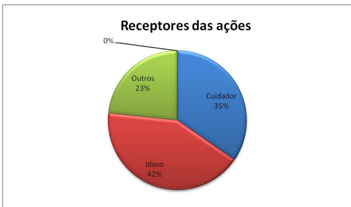
Graph 1. Receptor actions. (Other; Caregiver; Elder.)

From the analysis of data collected from 29 April to 7 May 2012 found 16 texts. The actions described in the texts were grouped into two broad categories: those related to the caregiver, family and facing the demented elderly. Of 107 listed stocks, 37 were directed to the caregiver-family, 45 to 25 and older were several actions that do not fit into any of these categories.