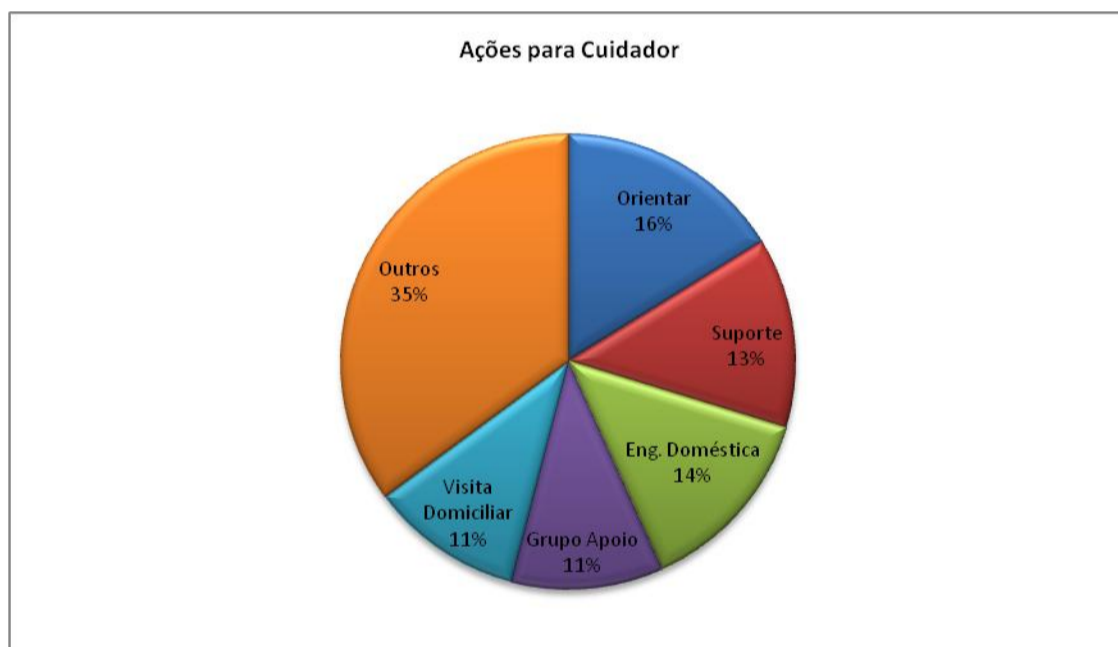
Graph 2. Actions for caregiver. (Other, To guide; To support; Domestic eng.; Group of support; Domiciliary visit)

There were found 13 stocks that were grouped in the category titled other, involving the help and care of the caregiver by telephone in emergency situations, knowing the caregiver and what their needs are, taking into account the psycho-affective between the caregiver and the elderly.