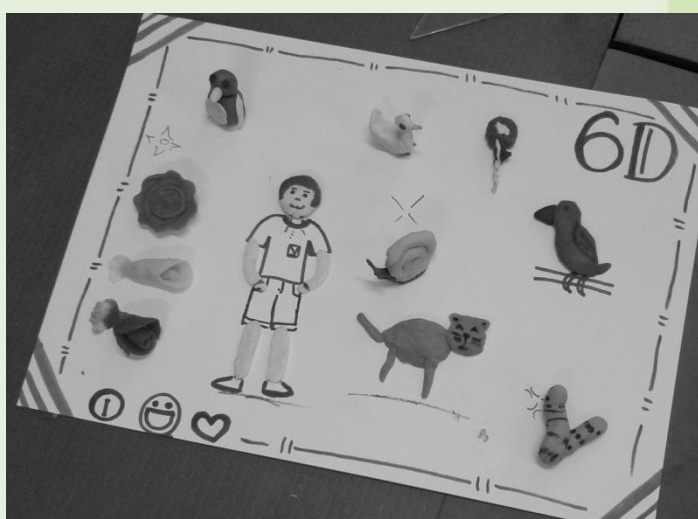
Figure 2: Hospitalized client is placed in a cabin that offers the possibility to view the factors inherent in his life outside hospital.

Nursing student 8 had Figure 2: set up a booth in 6D interactive so that the person admitted for a long time to check on your plants in the garden or pots and or your pet.