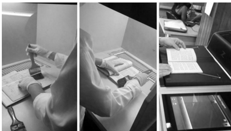
Figure 3 – Hygiene and scanning process

After the hygienization process, to ensure the dissemination of the information contained in the support, the work is digitized and made available in SophiA software, used for document management of the UNIRIO Library System. Figure 3 below shows, respectively, the hygiene and scanning process.