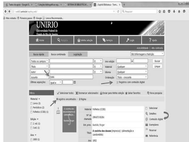
Figure 4 – Memory Collection in the online catalog

Figure 4 shows the initial screen of the search result in the online catalog of items from the special collections; Figure 5 shows the available digital content, and, finally, Figure 6 shows an example of the technical diagnostic sheet of the physical item.