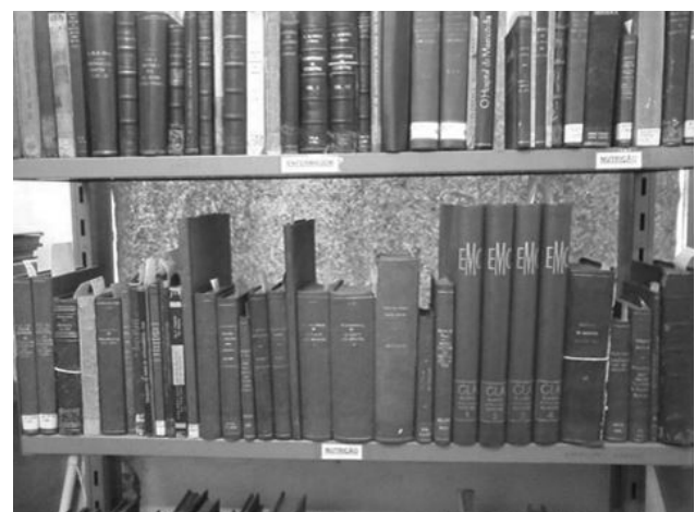
Figura 1 – Memory Collection

In order to protect the collections of the intrinsic and extrinsic agents of paper degradation, the works were allocated on specific shelves, separating them from the general collection and restricting the physical access to the works, as shown in Figure 1 below: