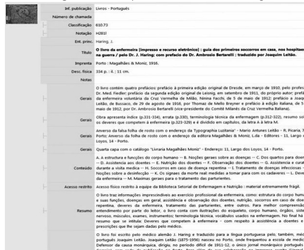
Figure 5 – Digital content