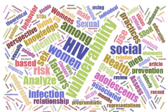
Figure 4 - General Corpus word cloud. Recife, PE, Brazil, 2020.

In Figure 4 , it can be seen that in the first sphere, the words HIV, vulnerability and woman are highlighted, which have frequency of 86, 59 and 45, respectively. Next, the words use, health, sexual appear with 41, 39 and 37 times, respectively. It is noticeable how important these terms are within their scope, since these words are correlated with the title and abstract Figure 4 .